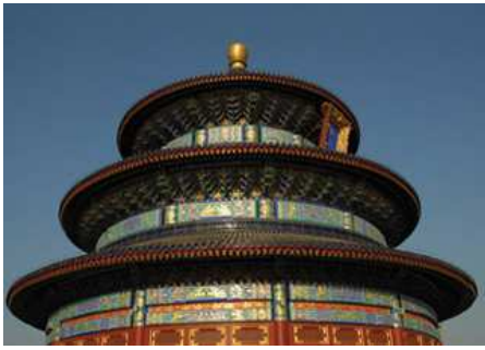
Temple of Heavens