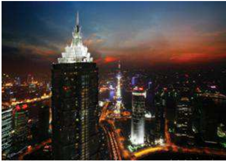
Shanghai Pudong Skyline