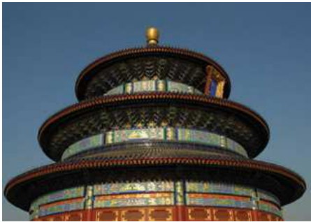
Temple of Heaven