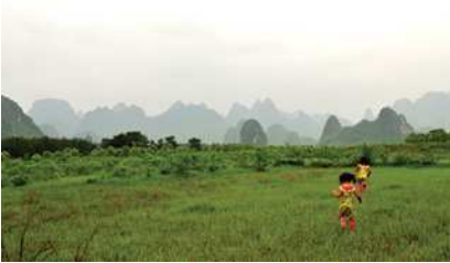
Lush Guilin Countryside