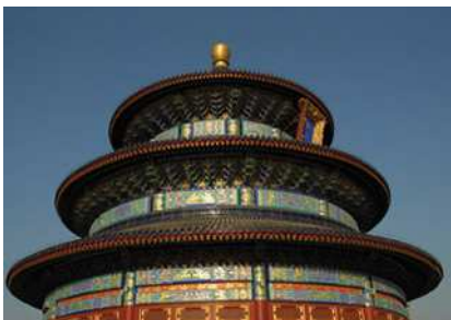
Temple of Heaven