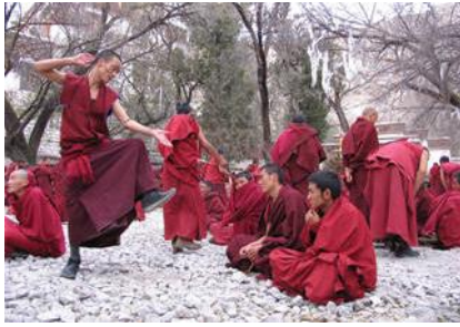
Sera Debating Monks