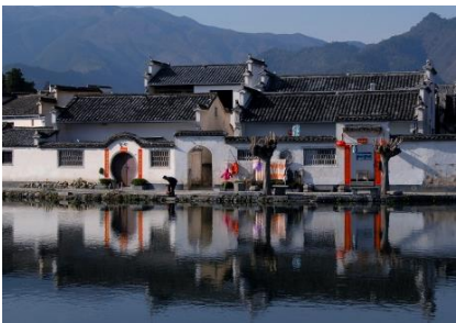
Ming Dynasty Village