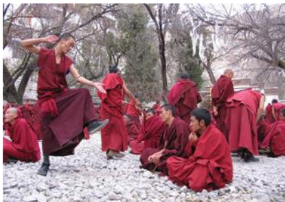
Sera Debating Monks