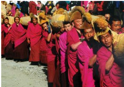
Monks on Parade