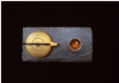
Traditional Tea Ware