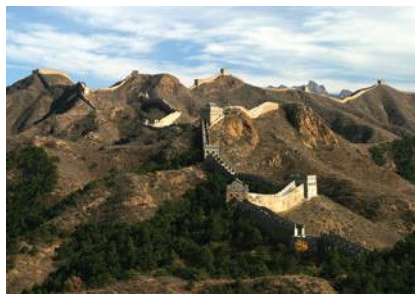
The Great Wall