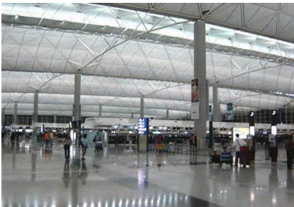
Hong Kong Airport