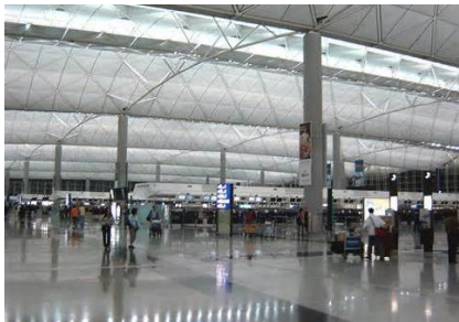
Hong Kong Airport